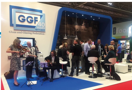
Anniversary Party at the FIT Show