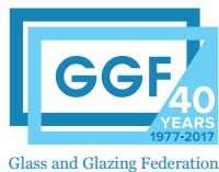
Glass and Glazing Federation